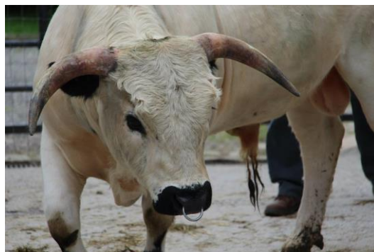
Photo of Pass Plus bull Broadecton Clayton